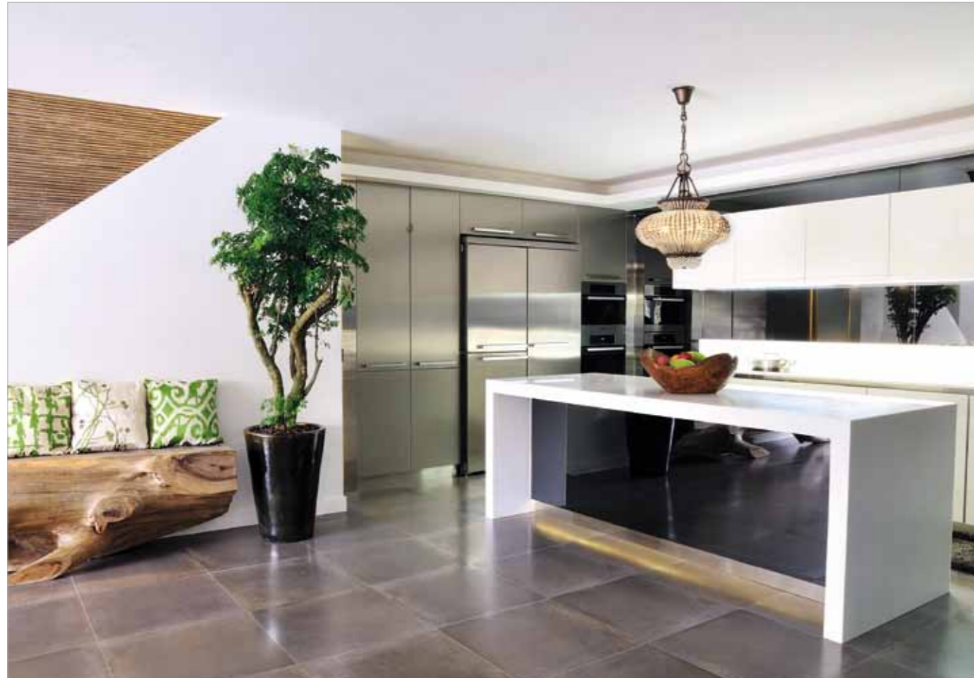
TOP TO BOTTOM: LEICHT's Versailles kitchen is all about French elegance. Top it off with a chandelier; a 1920s-style chandelier and smoky glass panels give this Sai Kung kitchen its glamorous feel

上至下圖：LEICHT的廚房組合Versailles極具法國氣息，可再用吊燈加以襯托；一盞具有20年代風格的吊燈、灰色的玻璃板等，令這個位於西貢的廚房顯得氣派萬千