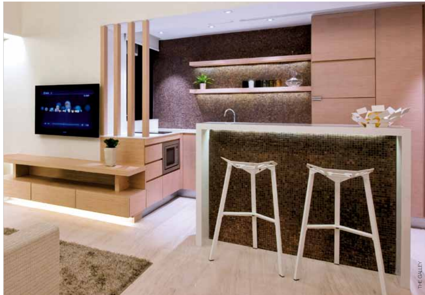
TOP TO BOTTOM: Hand-crafted cabinetry and high gloss surfaces characterise ALNO's ALNOPOL kitchen; shimmering mosaic tiling can provide an elegantly decorative touch. The Galley designed this kitchen 上至下圖：ALNO的ALNOPOL廚櫃系列由人手製造的櫃子和超亮澤的面材組成，款式獨特；閃亮的馬賽克磚，令這個由The Galley設計的廚房倍顯優美